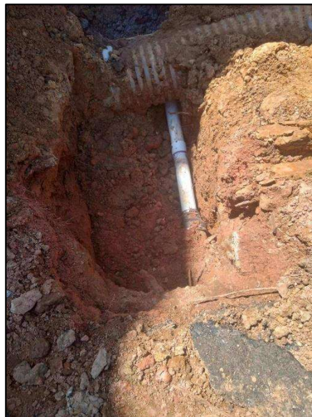
Figure 2 – New polyvinyl (PVC) pipe tie into the sewer main.