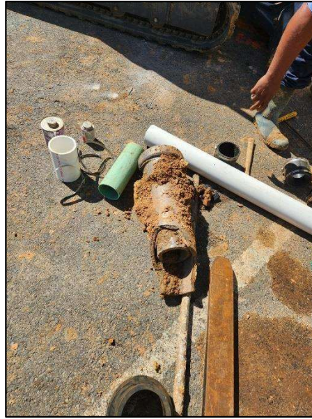
Figure 1 – Smaller diameter pipe shoved into a larger diameter pipe at the break, as described in Mr. Slone’s and Mr. Powell’s emails.

Four photographs were provided and are depicted as Figures 1 through 4 below.