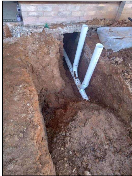
Figure 3 – Continuation of the PVC pipe depicted in Figure 2 into the crawlspace of Mr. Watts’ building. Note the cleanouts as described in Mr. Slone’s and Mr. Powell’s emails.