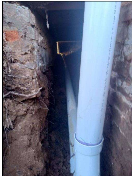
Figure 4 – Continuation of the PVC pipe depicted in Figures 2 and 3 into the crawlspace of Mr. Watts’ building. Note the cleanouts as described in Mr. Slone’s and Mr. Powell’s emails.